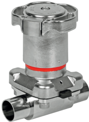
Steripur 907, T01